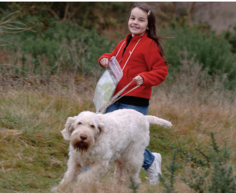
Countryside Agency / Apex